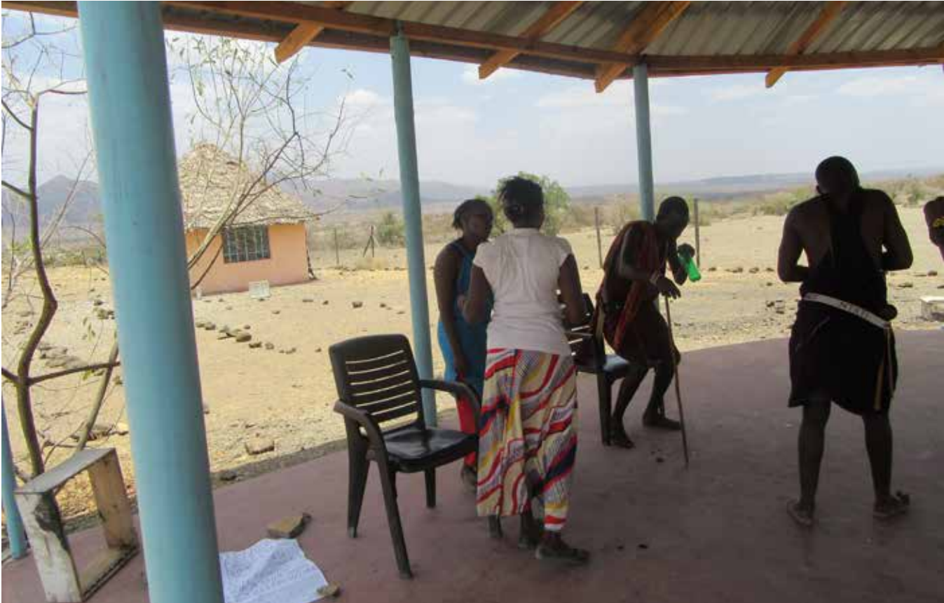
Community members record videos to dramatize the challenges of food insecurity.

Participatory video: Community members developed a script to dramatize the challenges they face in their daily lives. They then acted out the script, depicting first-hand their experiences with food and nutrition insecurity. This was recorded on video for later dissemination.