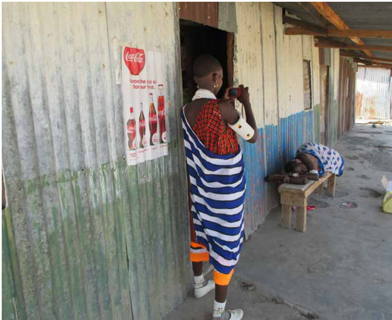
Maasai women take pictures of their surroundings and community.

Looking at food and nutrition security through the eyes of the Maasai community